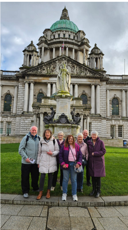
Belfast Town Hall

Next up for spring is a Portree visit in April, followed by a busy May with a 'Waverley' cruise and an overnight visit to take in Cowden Japanese Gardens (Fife) and Branklyn gardens (Perth). A special U3A travel group experience at RAF Lossiemouth now looks likely in May for a restricted team of members (12) due to obvious RAF security requirements. Clearly this one will be dependent on the situation with global issues at the time.