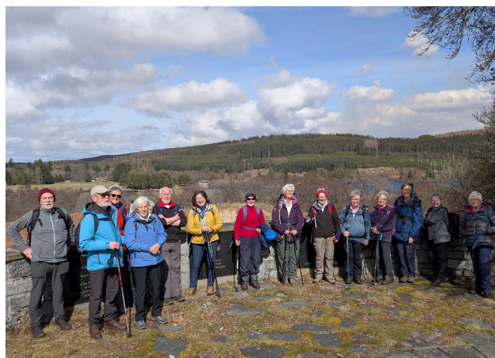
Mackintosh Memorial, Loch Moy